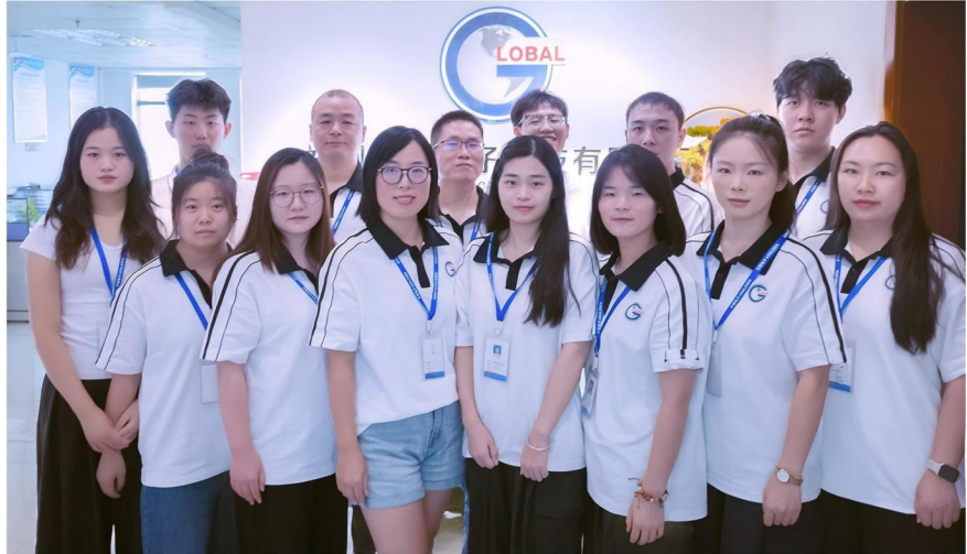
Professional Wireless Solutions Team - Leheng